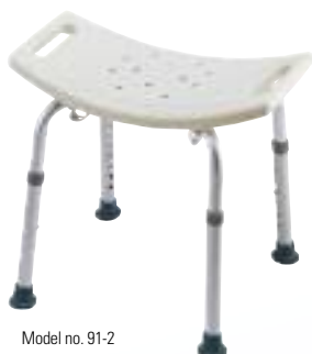
Model no. 91-2