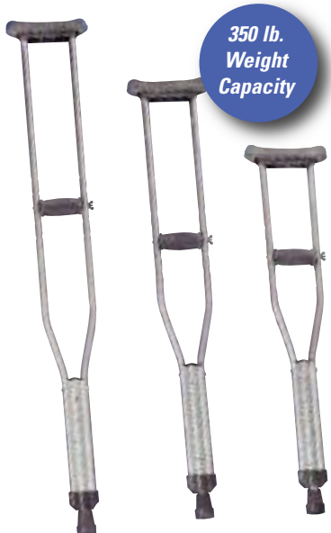
Model no. 8115-T Model no. 8115-A Model no. 8115-J