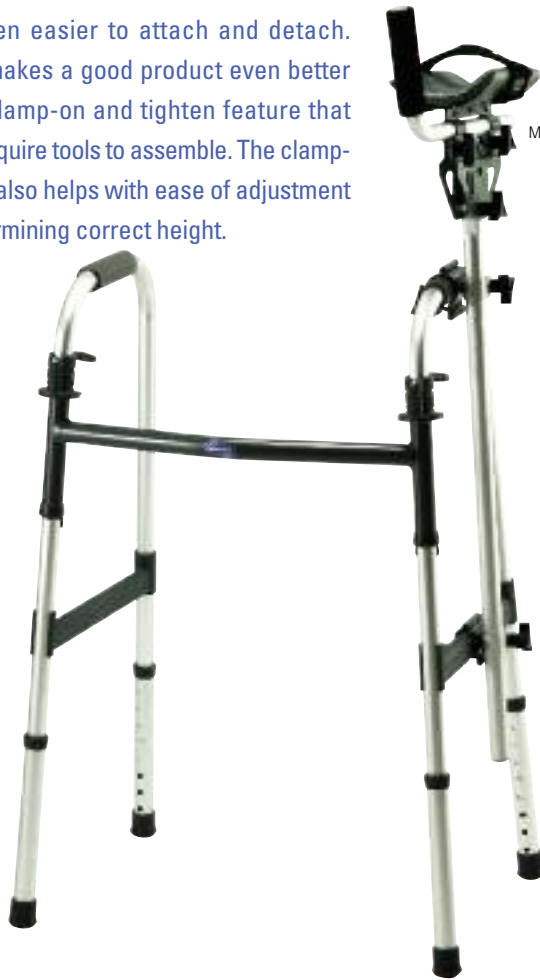
Model no. 6027

The Invacare Walker Platform attachment is now even easier to attach and detach. Invacare makes a good product even better with a 2" clamp-on and tighten feature that does not require tools to assemble. The clamp-on feature also helps with ease of adjustment when determining correct height.