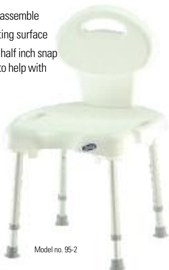
Model no. 95-2