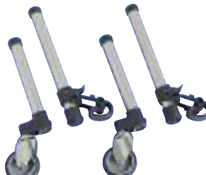
3" Swivel Wheels with 13" Cambered SureGlide™ Brakes