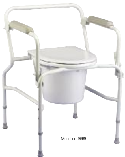
Model no. 9669