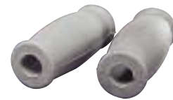
Model no. 7126