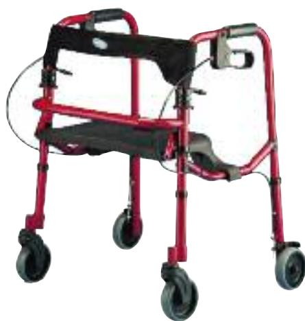
Color: Electric Red Model nos. 65100R Rollite Adult, 65100R-JR Rollite Junior (shown)

The Invacare line of Rollite® Rollators is unlike any other rollator line in the industry. Invacare has taken the Rollite one step further, offering the sizes, wheel types, and colors that consumers want. The Rollite line offers adult and junior sizes in different colors. For improved mobility over rougher terrain, large 8" wheel models are available in adult and tall sizes (Midnight Blue color). Along with additional features, the Rollite line provides the comfort, durability and quality that consumers have come to expect from Invacare products.