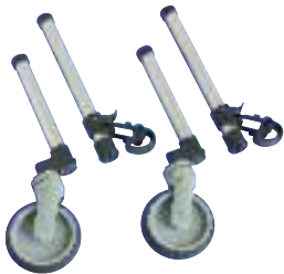
5" Swivel Wheels with 13" Cambered SureGlide™ Brakes