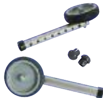
5" Single Fixed Wheel Attachments with Rear Glide Tips