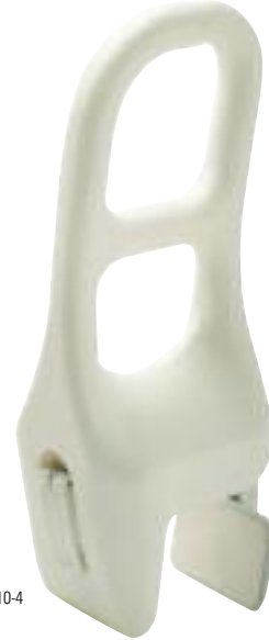
Model no. 710-4