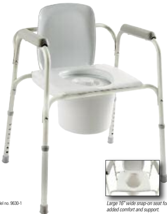
Model no. 9630-1

The Invacare® All-in-One Commode offers consumers the comfort and stability they need. The frame is lightweight. With its 16-inch wide seat, consumers gain additional comfort and support. The Invacare All-in-One Commode can be used bedside, or can act as a toilet safety frame or raised toilet seat.