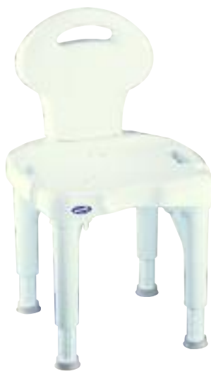
Model no. 9781