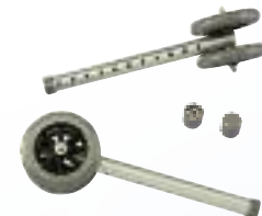
Bariatric Wheel Kit

Model no. 6372 only to be used with Invacare bariatric walker 6441-A