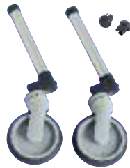
5" Swivel Wheel Attachments with Rear Glide Tips