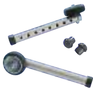
3" Single Fixed-Wheel Attachments with Rear Glide Tips