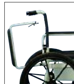
Flip-back padded arms that lock down for safety.