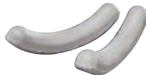
Model no. 7131