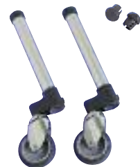
3" Swivel Wheel Attachments with Rear Glide Tips