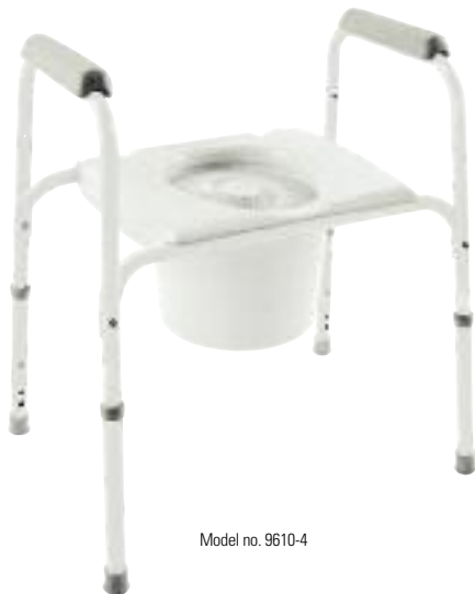
Model no. 9610-4