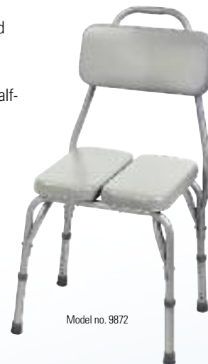
Model no. 9872