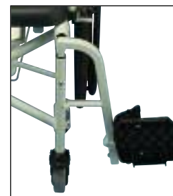
Swing-away front riggings with tool-less adjustable height footrests.