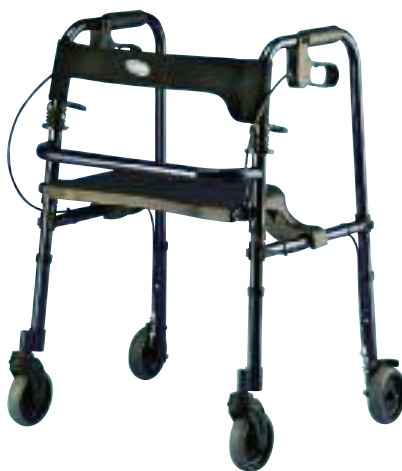
Color: Midnight Blue Model nos. 65100 Rollite Adult (shown) 65100-JR Rollite Junior