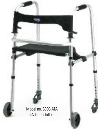
Model no. 6300-ATA (Adult to Tall)