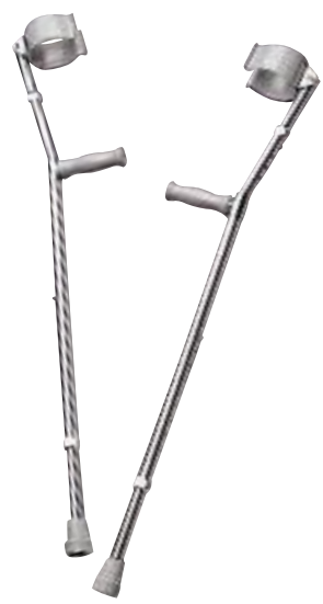
Model no. 6153