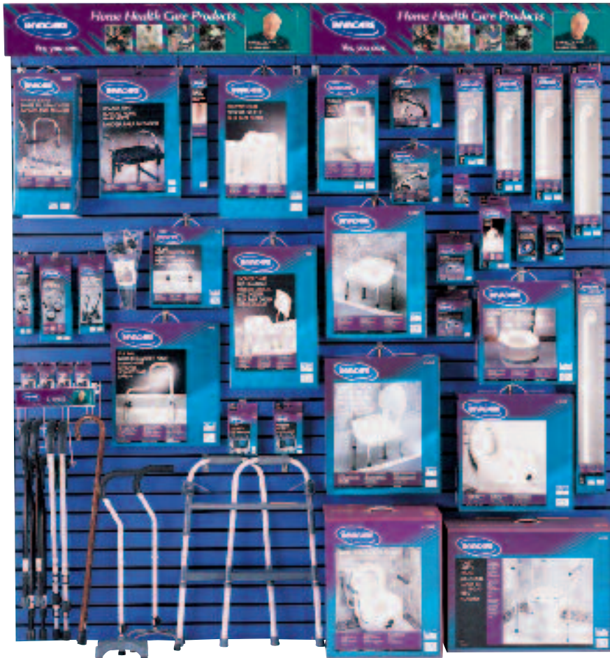
Planogram designs are subject to change without notification. Contact Sales Support at 800-333-6900 for up-to-date information.

For additional information and support on building consumer sales, contact your Territory Business Manager or 1.) go to www.invacare.com 2.) Under 'browse catalog' select self-care and patient aids 3.) Click on 'planogram' icon 4.) Browse merchandising display options