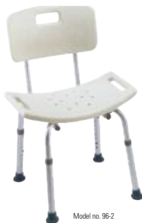
Model no. 96-2