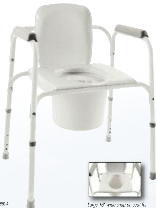
Model no. 9650-4