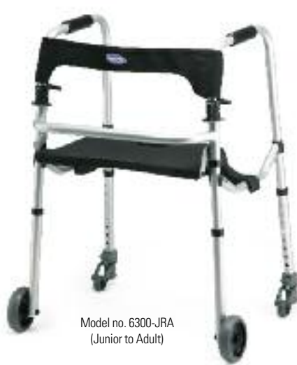
Model no. 6300-JRA (Junior to Adult)

The Invacare® WalkLite™ Walker revolutionized the world of walkers by addressing the needs of providers, clinicians and consumers at an affordable price. The line of walkers covers a wide range of consumer heights from Junior to Tall Adult. The WalkLite models continue to feature all the benefits of the original WalkLite – a comfortable flip-up seat, durable front 5" fixed wheels, rear spring-loaded SureGlide™ brakes, a lightweight aluminum frame with flexible backrest and ergonomic dual-paddle folding mechanisms.