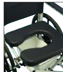
Padded four-position seat.