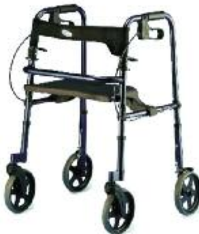
Color: Midnight Blue Model nos. 68100 Rollite Adult w/8" wheels, 68100-TA Rollite Tall Adult w/8" wheels (shown).