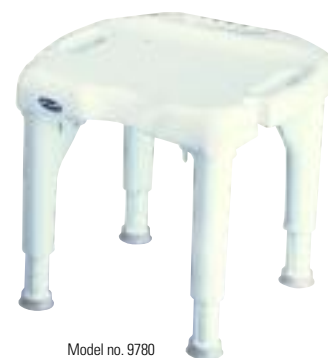
Model no. 9780