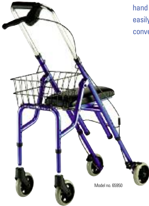
Model no. 65950

Introducing the new Invacare® Knee Walker. The Knee Walker is a great alternative for those who are weary of the discomfort related to crutches. It features a comfortable knee pad for resting the wounded limb, and it is easily maneuverable with its five-inch front swivel wheels. Its easy-to-operate ergonomic hand brakes keep the consumer in control. In addition, the Knee Walker folds easily for storage or transport, and it comes with a basket for the consumer's convenience.