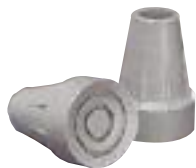
Model no. 6135